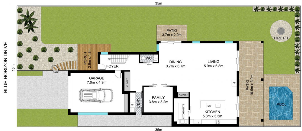
GROUND FLOOR & SITE PLAN