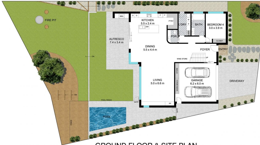
GROUND FLOOR & SITE PLAN