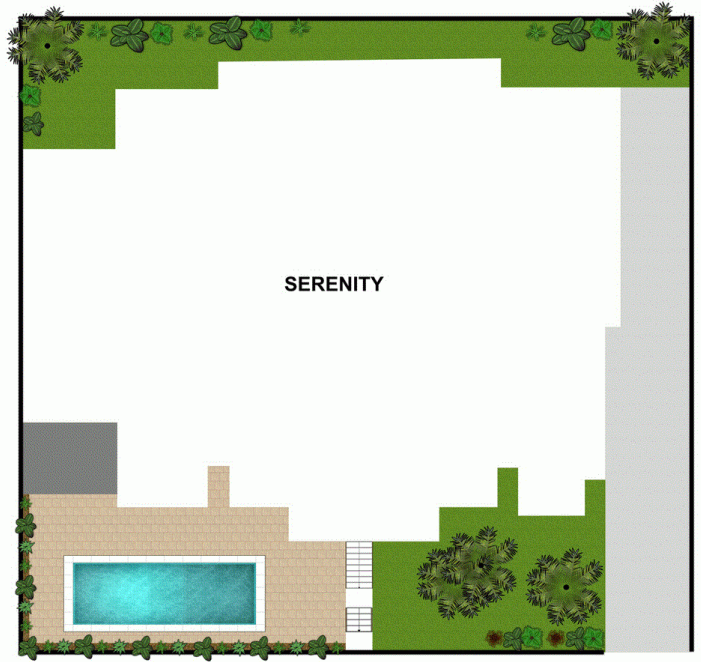
NB. Site plan not to scale

Scale in metres. Indicative only. Dimensions are approximate. All information contained herein is gathered from sources we believe to be reliable. However, we cannot guarantee its accuracy and interested persons should rely on their own enquiries.